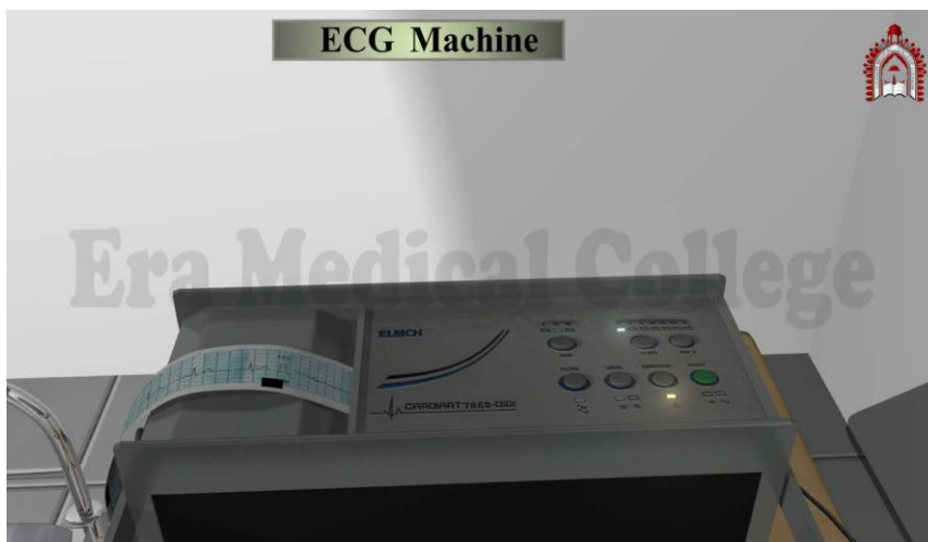
Fig. 2: Traditional ECG machine