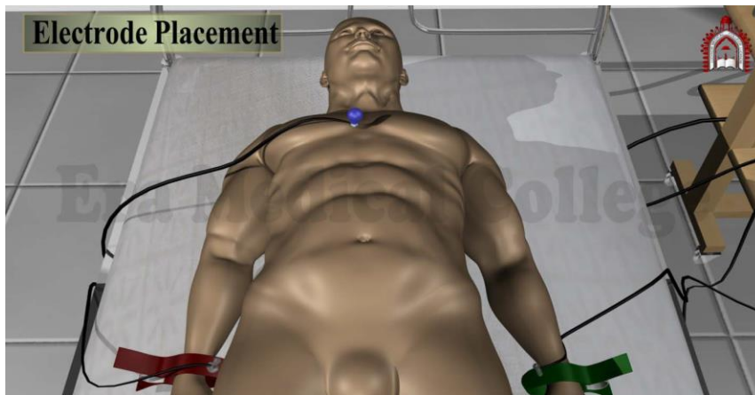
Fig. 1: Snap shot depicting site of electrode placement